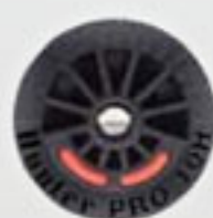
PRO-SPRAY FIXED ARC NOZZLES