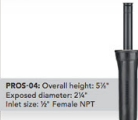
PROS-04: Overall height: 5½" Exposed diameter: 2¼" Inlet size: ½" Female NPT