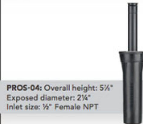
PROS-04: Overall height: 5½" Exposed diameter: 2¼" Inlet size: ½" Female NPT