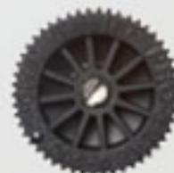
PRO ADJUSTABLE NOZZLES