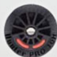
PRO-SPRAY FIXED ARC NOZZLES