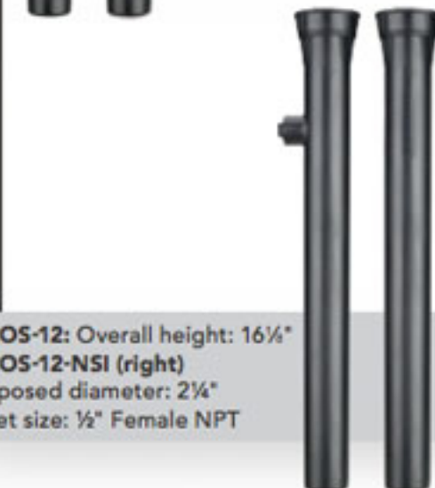
PROS-12: Overall height: 16½" PROS-12-NSI (right) Exposed diameter: 2¼" Inlet size: ½" Female NPT