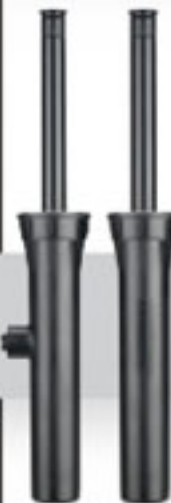
PROS-06: Overall height: 8¾" PROS-06-NSI (right): Exposed diameter: 2¼" Inlet size: ½" Female NPT