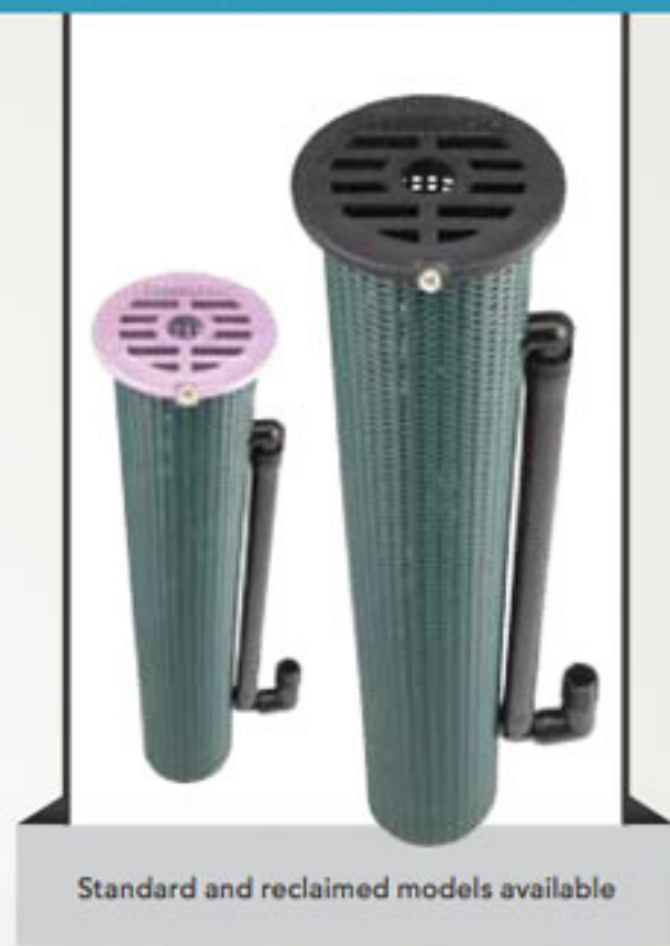
Standard and reclaimed models available