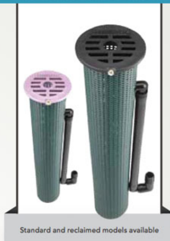
Standard and reclaimed models available